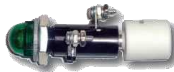
ET-16 Indicating Lamp

Terminals are readily available. They are designed for either AMP "FASTON" type connectors, solder, or screws. Nine basic color caps designed for maximum visibility are available for ET-16: Translucent - red, green, yellow, white. Transparent - amber, red, green, blue, and clear. Clear and transparent amber and red caps are offered for ET-17. (Note: Because of the special properties of neon, only these lenses are suitable.)