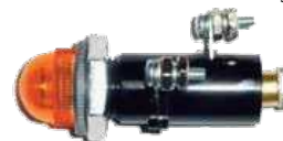
ET-17 Indicating Lamp